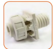
CAB-HOLD-E10 E10 HOLDER