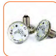
CAB-W-E10 COOL WHITE CAB-WW-E10 WARM WHITE